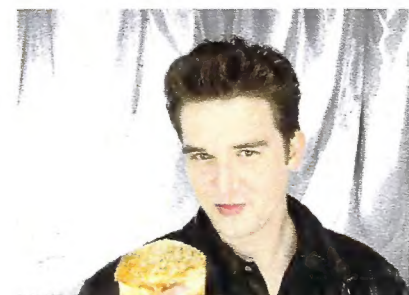
The Muffin Man?!

Got show ideas? Email us at cectv@ cecenterentertainment.com