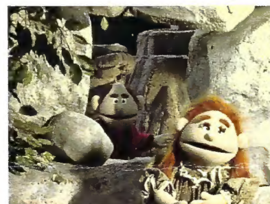
A Miner 49er and Clementine