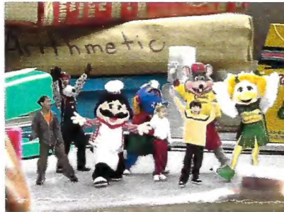
Honey, I Shrunk Chuck E. Cheese