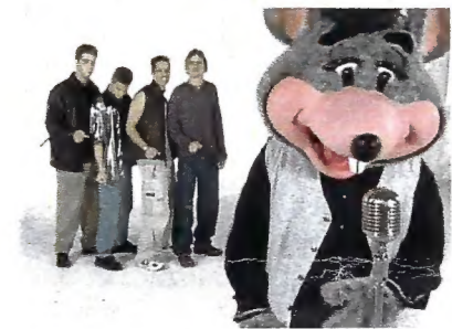
Chuck E. and the Muffin Boys