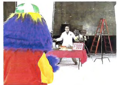
Behind the Scenes