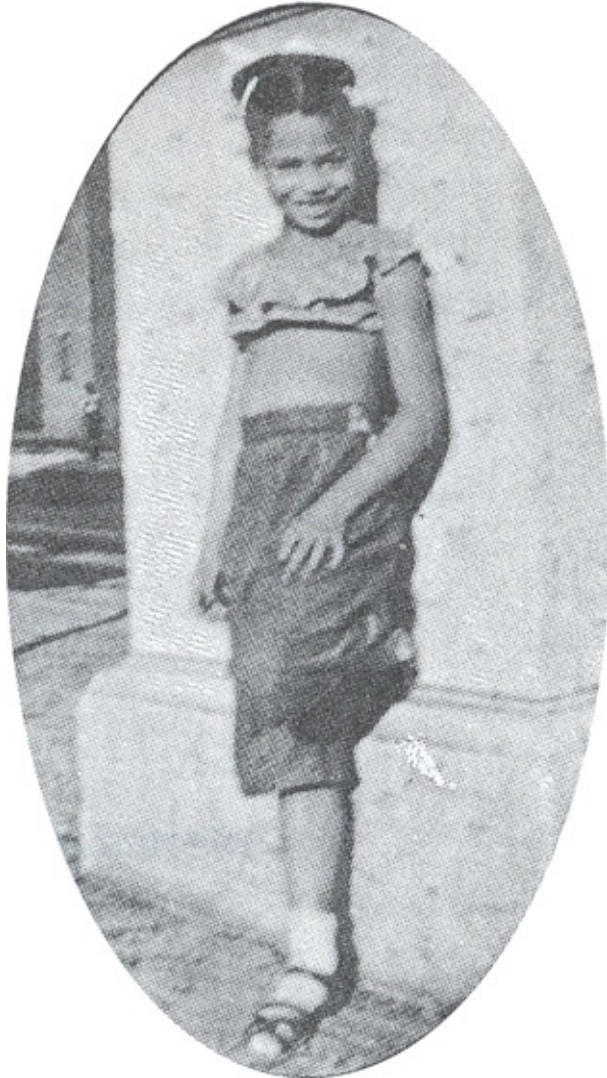
Visiting New York, July, 1951.