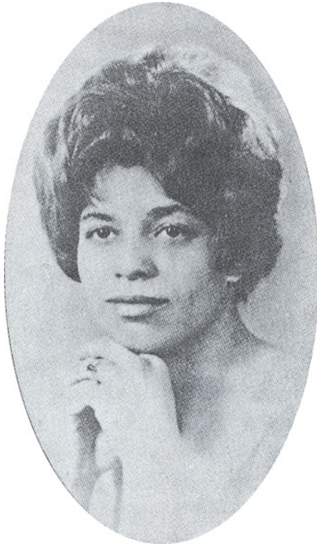
Junior year at Brandeis.